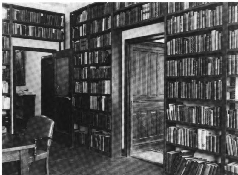
View of one of the rooms in the Hungarian Reference Library

mine when the material disappeared that was found to be missing from the collection when the Library of Congress acquired it in 1953. 86